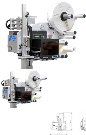
Etykieciarka opakowa? zbiorczych

ALcode is an industrial printer applicator designed to automatically print and apply self adhesive labels in real time 'one to one' (last label printed is the label applied) quickly, efficiently and reliably.