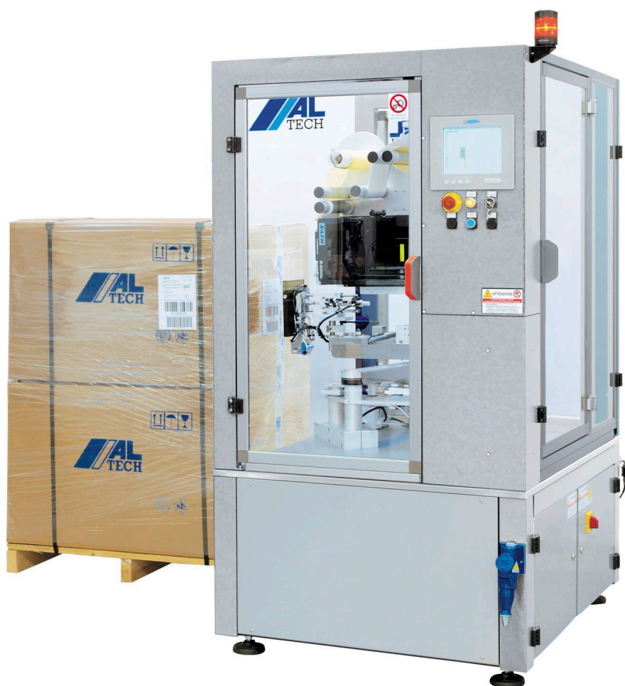
Etykieciarka palet ALcode P